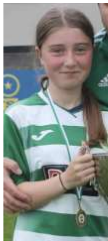
U14 Girls POTY