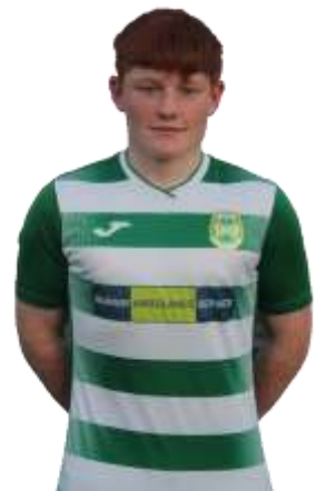
U16 Boys POTY