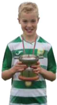
U13 Player of the Year

Check out the photos of all our award winners on our facebook page Castlebar Celtic F.C