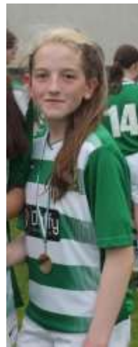
U15 Girls POTY